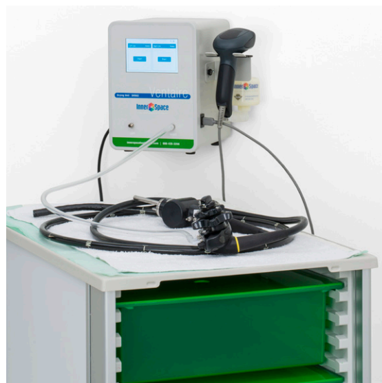
The counter-height cart does double duty as a work surface