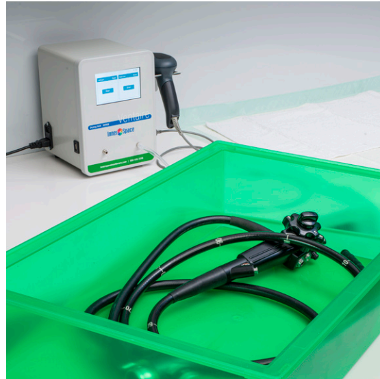
Trays are sized to hold extra-long scopes and additional supplies