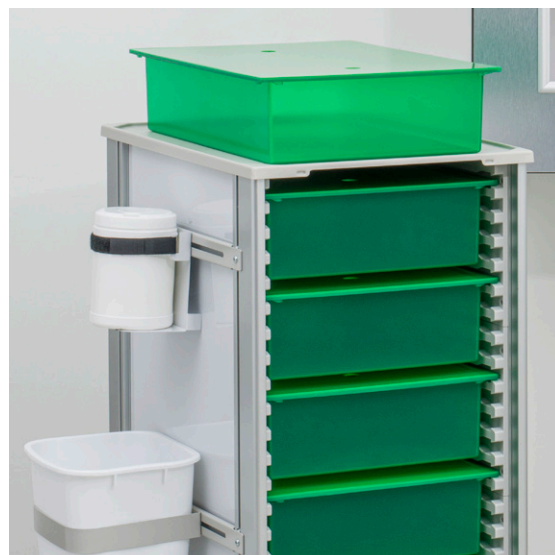
Flexcell interiors are easy to configure and reconfigure and hold multiple trays