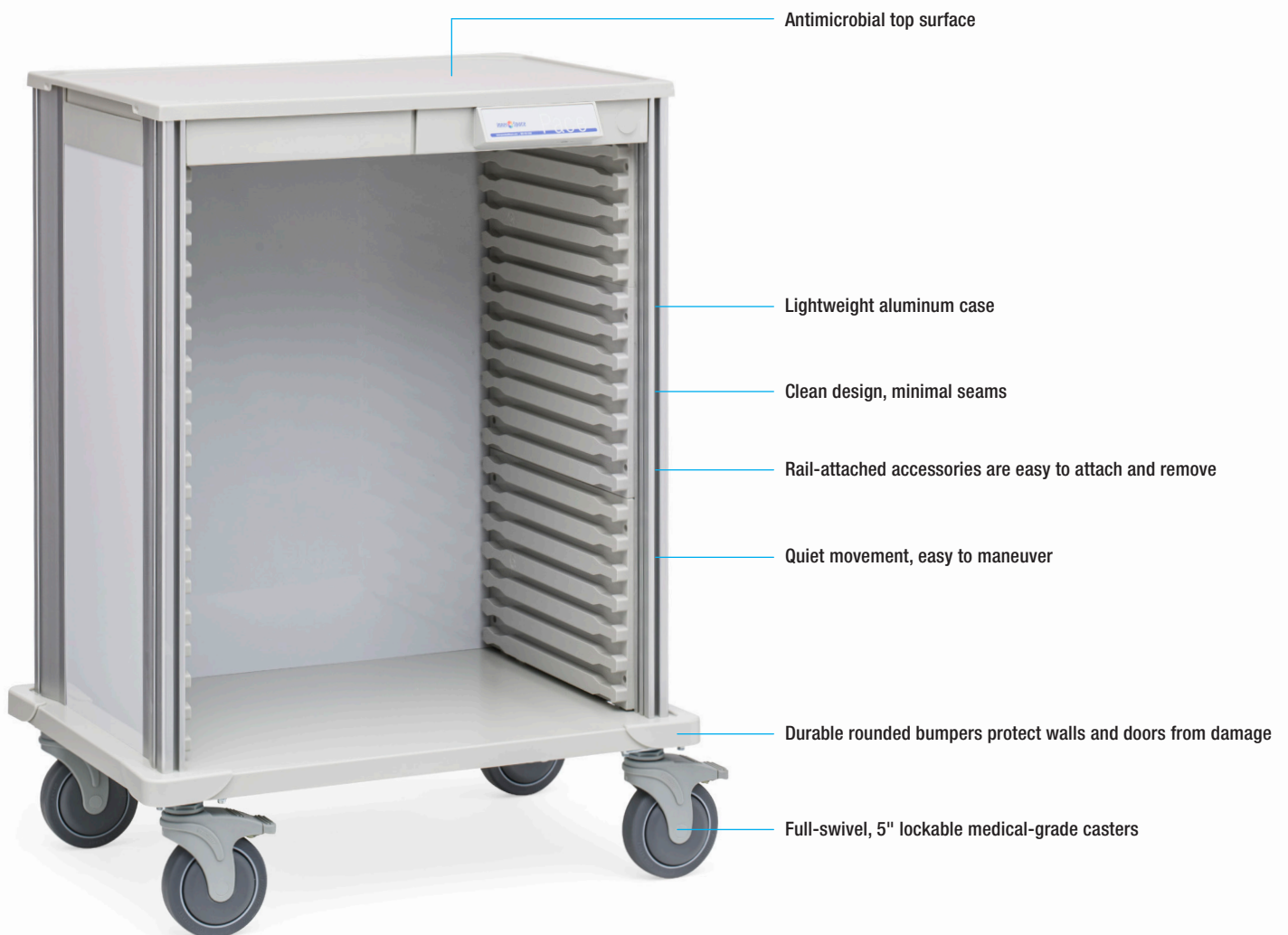
Product Shown: FlexCell Cart (SP27WC)

Pace carts are mobile, easy to maneuver, secure, and adaptable to change. The FlexCell Cart has an open front and full FlexCell interior. It has a white case. A variety of exterior accessories lets you target supply storage for specific treatments and departments.