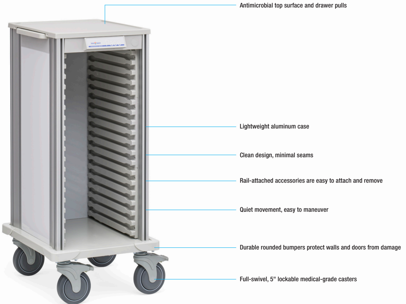
Product Shown: Narrow FlexCell Cart (SPN27WC)

Pace carts are mobile, easy to maneuver, secure, and adaptable to change. The FlexCell Cart has an open front and full FlexCell interior. It has a white case. A variety of exterior accessories lets you target supply storage for specific treatments and departments.