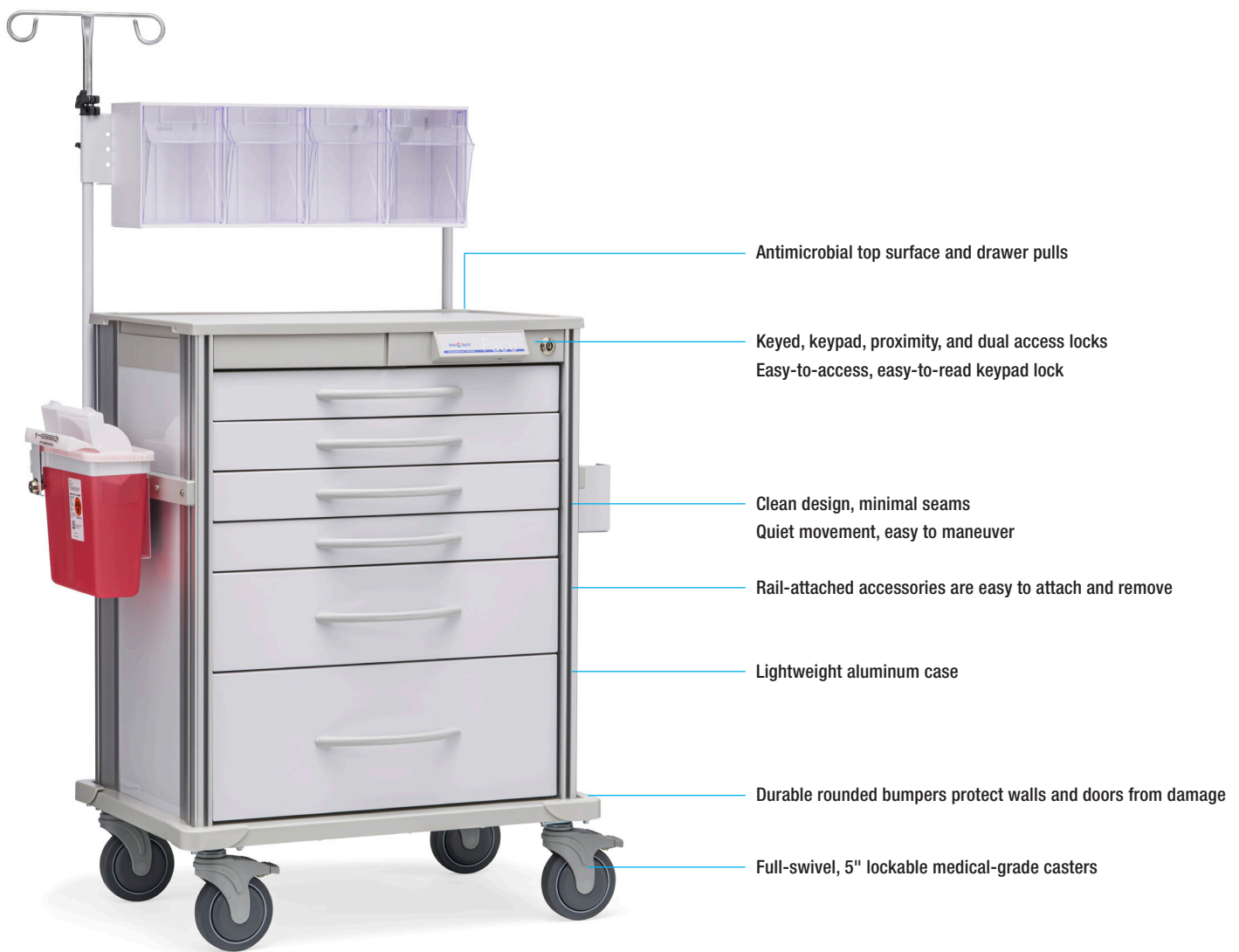
Product Shown: IV Prep Cart (SP27W6 with SPIVP)

Pace carts are mobile, easy to maneuver, secure, and adaptable to change. The IV Prep Cart includes an IV pole, upper accessory rail, set of 4 tilt bins, locking Sharps container, and glove box. A variety of drawer configurations and exterior and drawer accessories lets you target supply storage for specific treatments and departments.