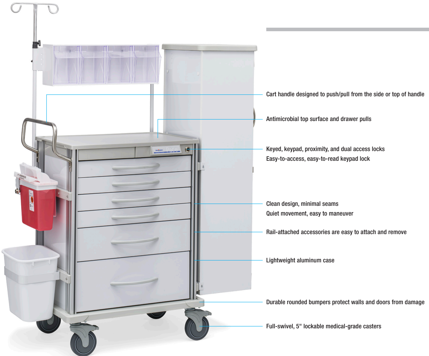
Product Shown: Difficult Airway Cart (SP27W6 with SPDAVP)

A variety of drawer configurations and exterior and drawer accessories lets you target supply storage for specific treatments and departments.