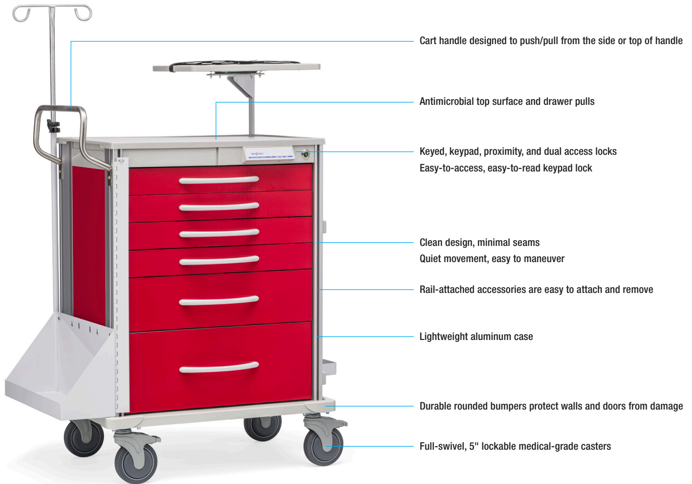
Product Shown: Code Cart (SP27R6 with SPCVP)

Pace carts are mobile, easy to maneuver, secure, and adaptable to change. The Code Cart is 29.25" wide and includes an IV pole, oxygen tank holder, resuscitation board, defibrillator shelf, breakaway lock bar, push handle, and suction pump holder. The cart case and drawer fronts are red. A variety of drawer configurations and exterior and drawer accessories lets you target supply storage for specific treatments and departments.