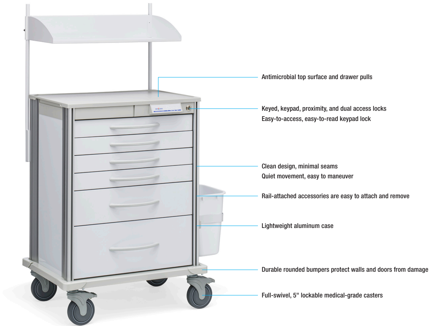
Product Shown: Cast Cart (SP27W6 with SPCTVP)

Pace carts are mobile, easy to maneuver, secure, and adaptable to change. The Cast Cart has an upper accessory rail, upper utility shelf, and waste basket. A variety of drawer configurations and exterior and drawer accessories lets you target supply storage for specific treatments and departments.