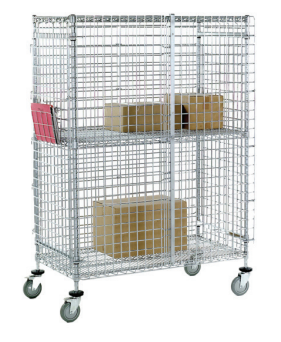
Shown with 1 optional shelf