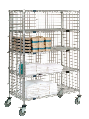
Shown with additional shelf and optional label holders