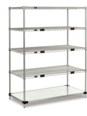
Shown with optional casters and label holders

Includes 4 chrome posts, 4 chrome wire shelves, and 1 solid galvanized shelf