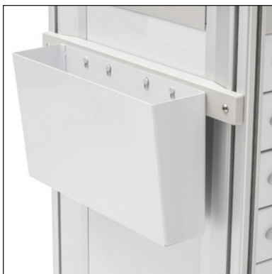
Chart holder attaches to the side rail on a Pace cart or to a fixed side rail on a Roam cart. Holds up to 5 pounds. Attachment hardware and side rail included.