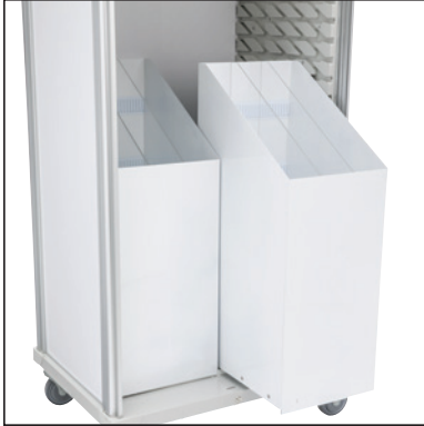
Boxed Catheter Insert with anti-tip mechanism shown

For use in a Roam cart or Evolve cabinet to hold catheters. Holds up to 50 pounds. Attachment hardware included. Uses 29 FlexCells.