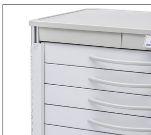
Breakaway lock bar (SPLB)