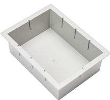
6" Tray SNT9 shown