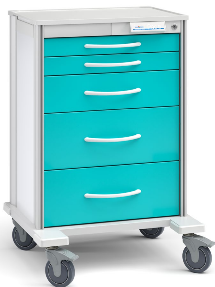
Pace 30 cart with Meadow drawer fronts: SP30WF with SP3DG (2 3" h drawers), SP6DG (1 6" h drawer), and SP9DG (2 9" h drawers)