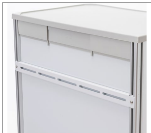
Back-Mounted Adjustable Rail (SAMRBP)