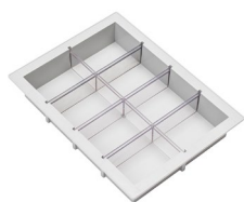
6" Tray SNTD6 shown