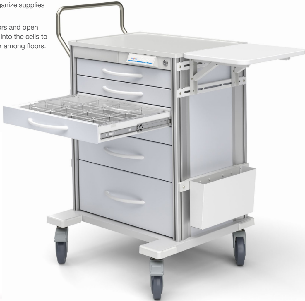
Pace 30 Pharmacy Cart with 3''h clear tray and divider kit (SP30W6 with SPPVP and SCTD3)