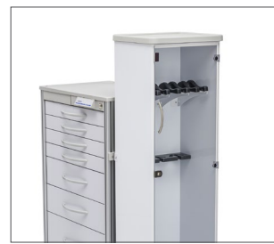
Side-Mounted Scope Cabinet (SSMSCP)