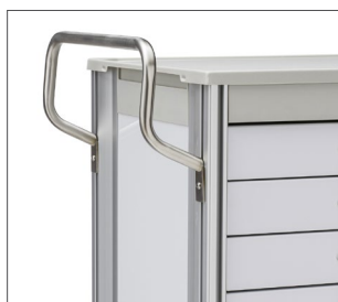
Push Handle (SPAPH)