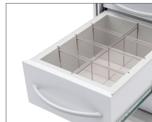
Trays are sized to fit both standard width and narrow Pace carts. Shown with 6''h narrow tray with 1 long and 3 short dividers (SNTD6)