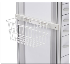
Wire Basket (SSMWB)