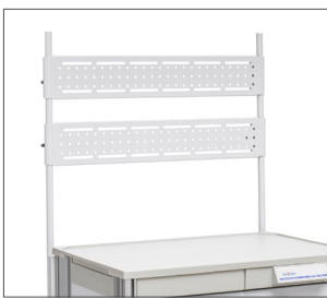
Top-Mounted Accessory Rail, double (SPUAR2)