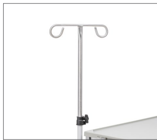
IV Pole (SIVPP)