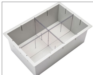
9''h tray with 1 long and 1 short divider (STD9)