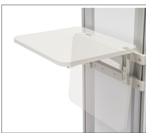
Flip-Up Work Surface (SFWSP)