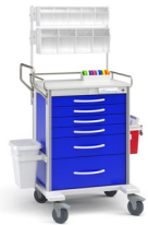
Pace 27 Anesthesia Cart shown

Standard-width cart with upper accessory rails, set of 4 tilt bins, set of 5 tilt bins, locking Sharps container, waste basket, push handle, wraparound rail, and tape dispenser. Royal blue case and drawer fronts.