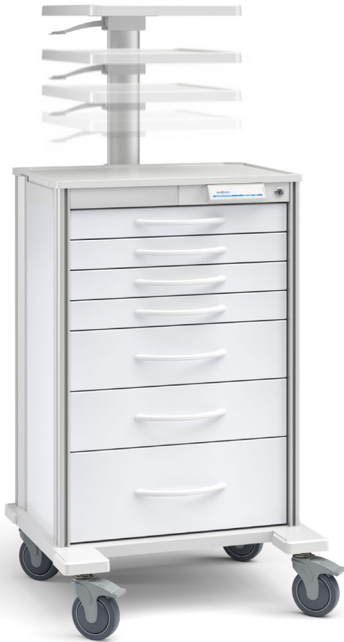
Pace 33 cart (SP33W7) with adjustable work surface (SPAWS)