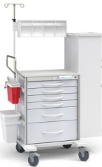
Pace 27 Difficult Airway Cart shown

Standard-width cart with side-mouneted scope cabinet, upper accessory rails, set of 4 tilt bins, IV pole, waste basket, locking Sharps container, and push handle.