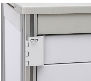
Single drawer breakaway lock (SPSBL)