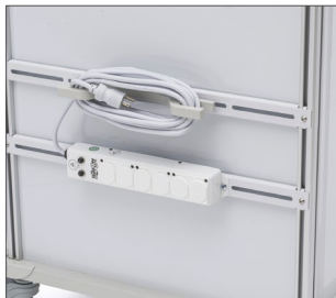
Cord Wrap (SCWP), Power Strip (SPSP)