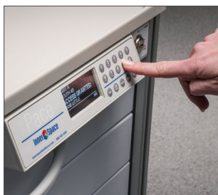
InterConnect lock (SPSDLW)