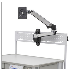
Flat Panel Monitor Arm (SFPMAP)