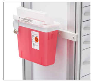
Sharps Container (SSCP)