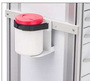
Disinfectant Holder (SRDHP)