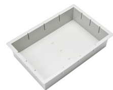
6" Tray ST6 shown