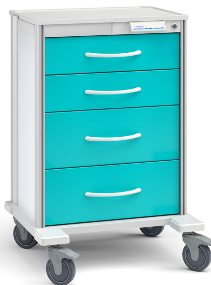
Pace 30 cart with Meadow drawer fronts: SP30WF with SP6DG (2 6" h drawers), and SP9DG (2 9" h drawers)