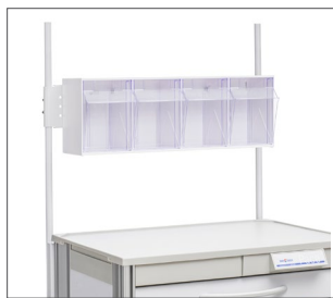
Tilt Bin, 4 compartment (STB4)