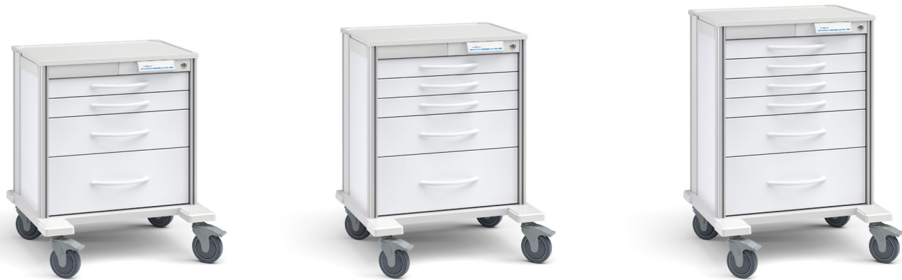
Pace 21 (SP21W4) Shown with 2 3"h, 1 6"h, and 1 9"h drawer configuration Exterior dimensions: 29"w x 24.5"d x 33"h Weight: 105 lbs

Pace carts come in two widths, five heights, and with 3"-, 6"-, and 9"-high drawers. Select from six case colors and 12 drawer colors. Carts can also be specified with smaller 3"- and 4"-high casters for under-counter applications.