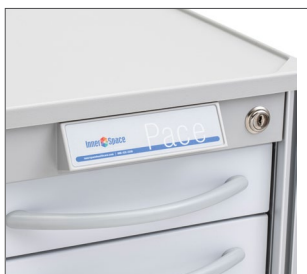
Keyed lock (standard)

Link InterConnect with the InnerSpace Cloud platform, and the lock becomes a WiFi-enabled lock system that lets you manage and track access of your cart fleet from a single computer, saving the time and effort that manual programming of every cart requires.