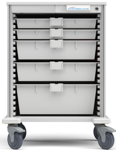
Pace 21 Transport Cart (SP21WC)

Pace transport carts have FlexCell interiors and open fronts. Trays, drawers, and baskets slide into the cells to transport supplies within a department or among floors.