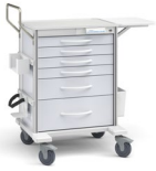
Pace 21 Pharmacy Cart shown

Standard-width cart with glove box holder, 2 security lock boxes, flip-up work surface, chart holder, disinfectant holder, 2 3" pharmacy trays, and push handle.