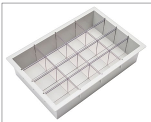
6''h tray with 3 long and 3 short dividers (STD6)