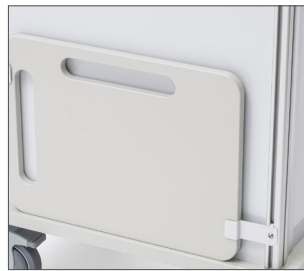
Resuscitation Board (SRBP)