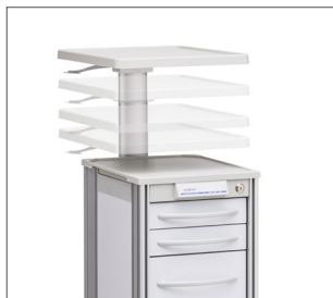
Adjustable work surface