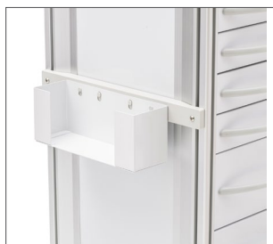
Glove Box Holder, single (S1GBHP)