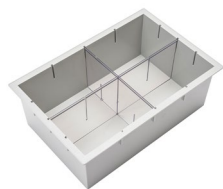
9" Tray STD9 shown