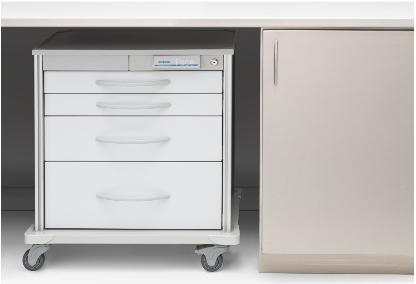
Pace under-counter 21 (SP21W4U3)

The cart base is designed for improved stability, even when multiple drawers are open. Pace carts are warranted for five years.