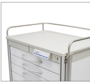
Surface Rail (SPWAR)