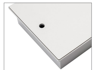
Optional tray lid (SSTL6) for 6''h smooth tray (SST6)