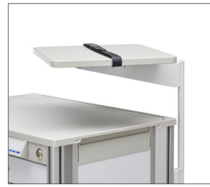
Defibrillator Shelf (SDSP)