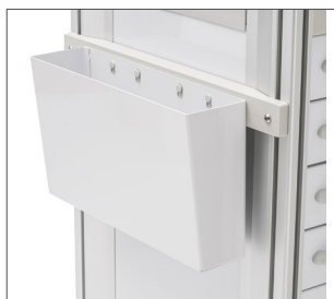
Chart Holder (SCHP)