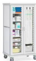
Roam Supply Carts

Solaire Medical | P.O. Box 2808 | Grand Rapids, Michigan 49501 888-435-2256 phone | 616-743-5944 fax | solairemedical.com