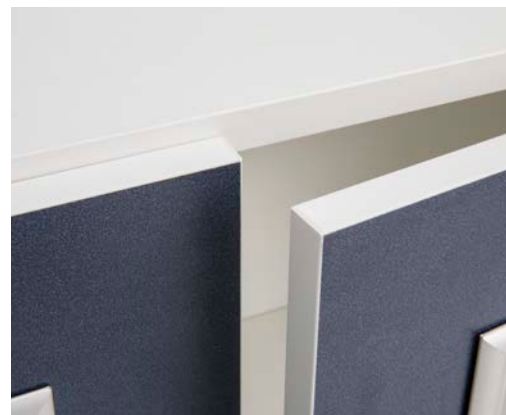
High-velocity heated air flow adheres edge banding to cabinet without seams or glue lines

Where wood or metal construction falls short, AireCore rises to the challenges of healthcare-appropriate storage