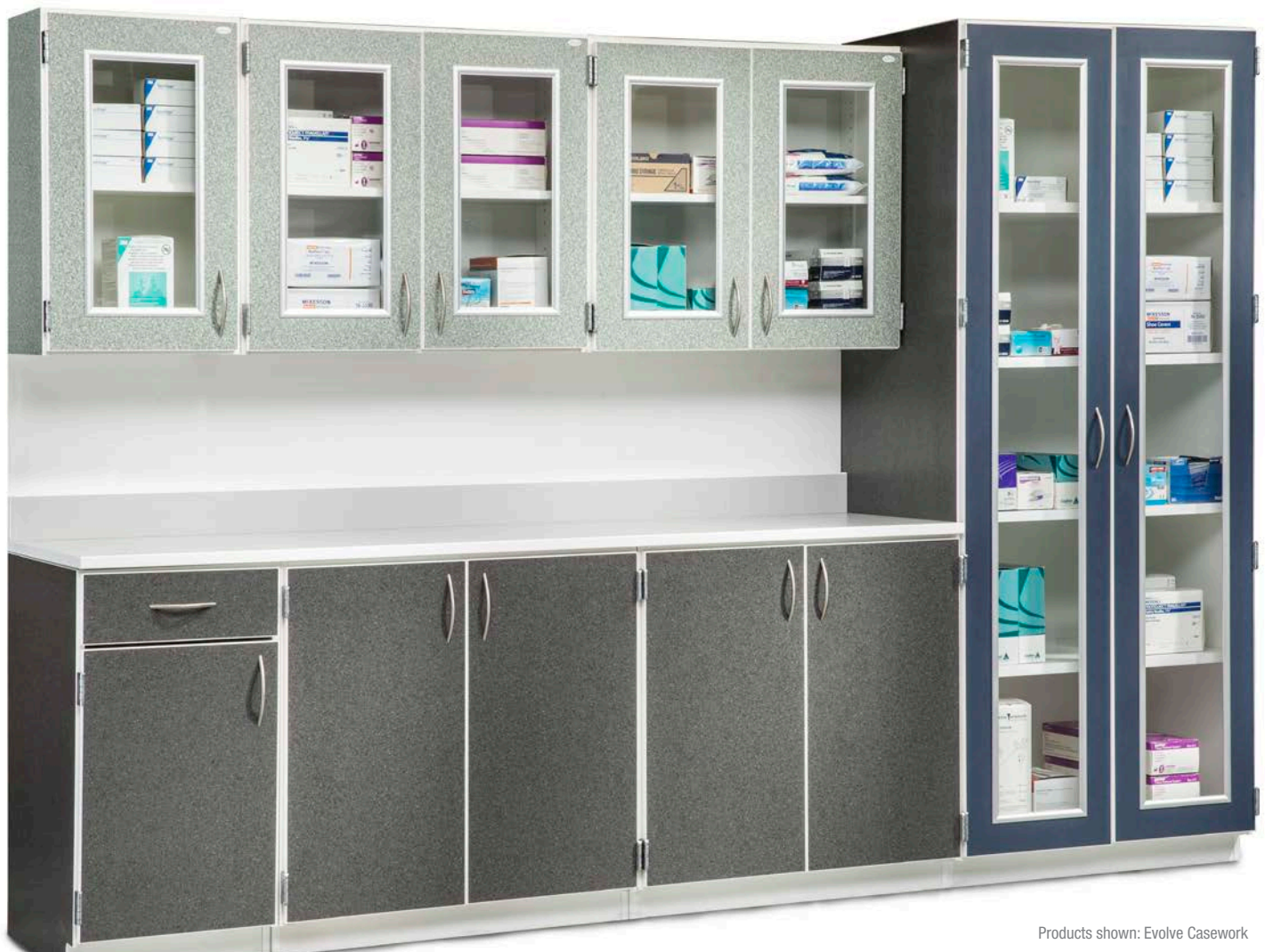
Products shown: Evolve Casework