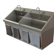
Double Station 27.5"d x 64"w x 37"h