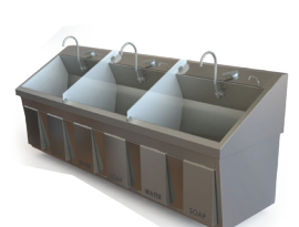
Triple Station 27.5"d x 96"w x 37"h