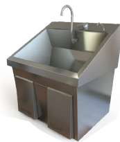
Single Station 27.5"d x 32"w x 37"h