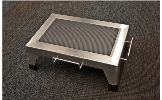
Single step stool with connecting hooks/carry handles.